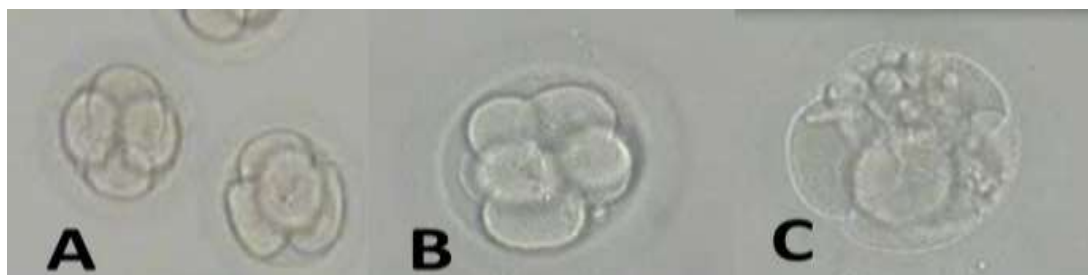
Figure 3. Types of embryo quality of in vitro Awassi sheep produced embryos. A: Type I. B: Type II. C: Type III.